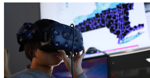
UAlbany XCite Lab