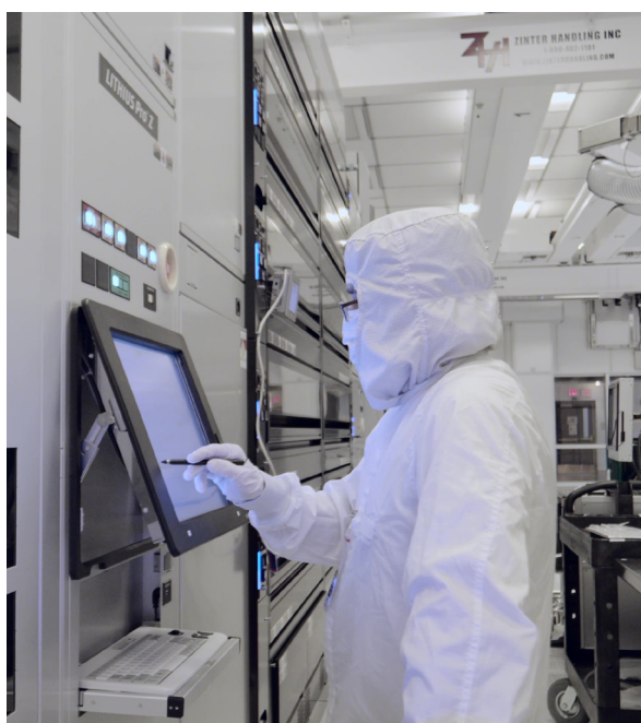
EUV work station at Albany NanoTech Complex