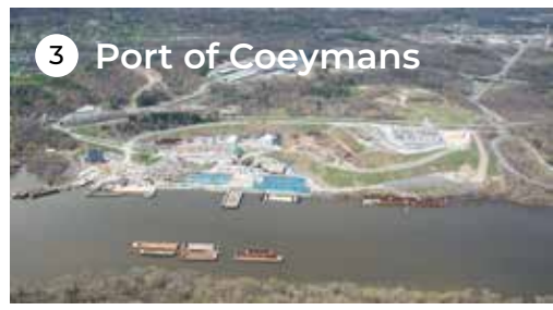
3 Port of Coeymans