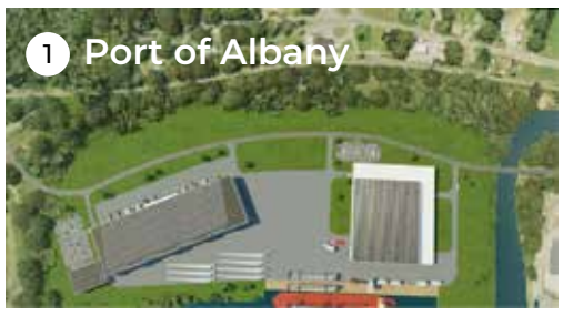
1 Port of Albany