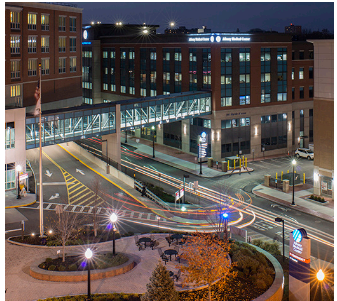
Albany Med Health System