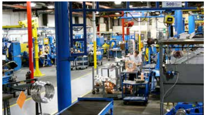
Umicore Technical Materials

Warren County's also has one of the nation's highest concentrations of medical equipment and supplies manufacturing jobs . Over the last 50 years, the area became renowned as the Catheter Valley, and companies such as AngioDynamics, Medline Industries, BD Becton Dickinson, Delcath Systems and Medline industries have kept that manufacturing tradition alive.