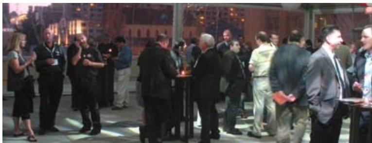
NY Loves Nanotech hosted its 11th Annual Dessert Reception with more than 300 attendees.